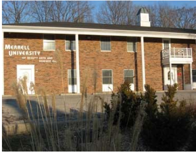
Administrative Offices/ Primary Facility*

1753 Woodclift Dr. Jefferson City, MO 65109 (573) 635-4433