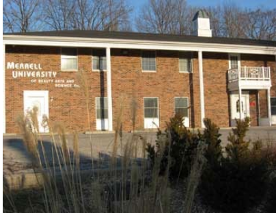
Administrative Offices/ Primary Facility*

1753 Woodclift Dr. Jefferson City, MO 65109 (573) 635-4433